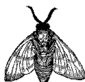
Figure 2: A sample black and white graphic that has been resized with the \includegraphics command.

the environment with figure* , not figure !