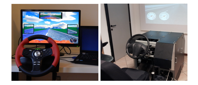
Figure 2: OpenDS drive simulator installation (left) and industrial stationary driving simulator with a SCANeR<sup>TM</sup>simulation engine (right). In the left part, the screen shows basic AI-based drive guidelines by the color projections (left blue lane represents change lane recommendation).

This demonstration presents the integrated multi-agent traffic simulation for human-in-the-loop cooperative drive