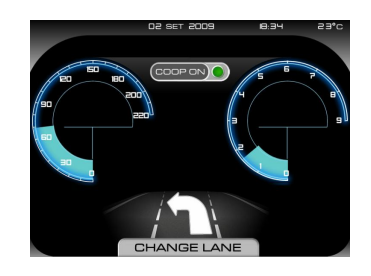
Figure 3: Example of the HMI dashboard for stationary driving simulator.

systems testing. Its openness and flexibility supports a wide range of testing and validation possibilities for the researchers and developers in the field of autonomous vehicles, cooperative drive, driver assistants, and HMI design and development. The system has been validated in the various settings of the integrated driving simulator, HMI interfaces, and cooperative car control techniques. The demonstration supports the usability and validity of the simulation for future car systems.