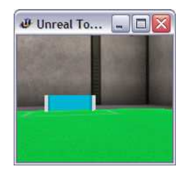
Figure 3: USARSim camera image simulation