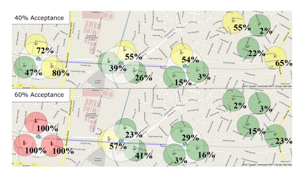
Figure 2: Results of the simulations, showing the car park's utilisation in percentage values.

form several simulations in which respectively 10.000 vehicles drive from an appointed source region to an appointed target region. We illustrate selected results in Figure 2.