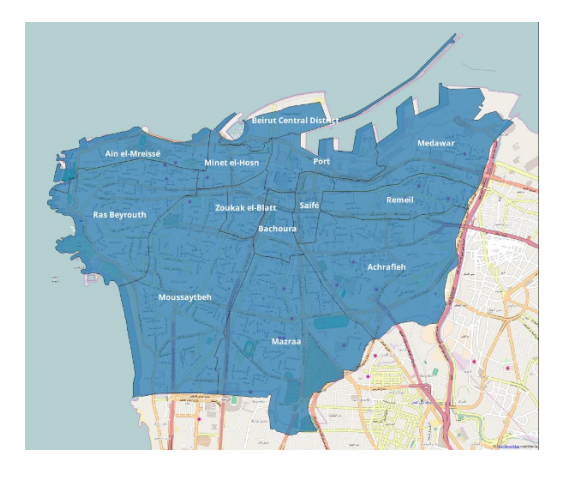
Figure 1: Metropolitan Beirut.

Proc. of the 17th International Conference on Autonomous Agents and Multiagent Systems (AAMAS 2018), M. Dastani, G. Sukthankar, E. André, S. Koenig (eds.), July 10−15, 2018, Stockholm, Sweden. © 2018 International Foundation for Autonomous Agents and Multiagent Systems (www.ifaamas.org). All rights reserved.