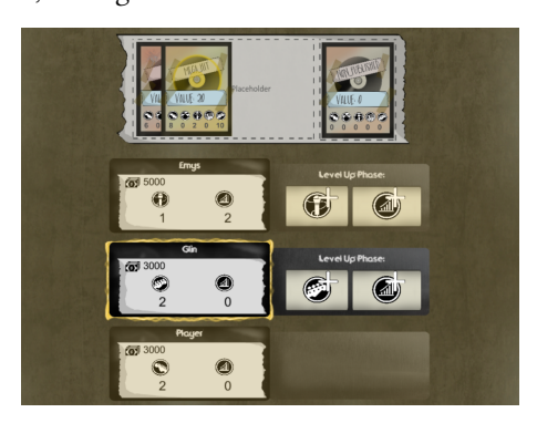
Figure 1: Interface of For The Record at the level up phase, where each player chooses to upgrade the instrument (cooperate) or to upgrade the marketing (defect).

Proc. of the 18th International Conference on Autonomous Agents and Multiagent Systems (AAMAS 2019), N. Agmon, M. E. Taylor, E. Elkind, M. Veloso (eds.), May 2019, Montreal, Canada. © 2019 International Foundation for Autonomous Agents and Multiagent Systems (www.ifaamas.org). All rights reserved.